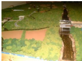
COUNTY MODEL RAILROAD

THE MACON COUNTY HISTORICAL MUSEUM IS A NONPROFIT EDUCATIONAL ASSOCIATION THAT COLLECTS, PRESERVES AND INTERPRETS THE HISTORY OF MACON COUNTY, GEORGIA.