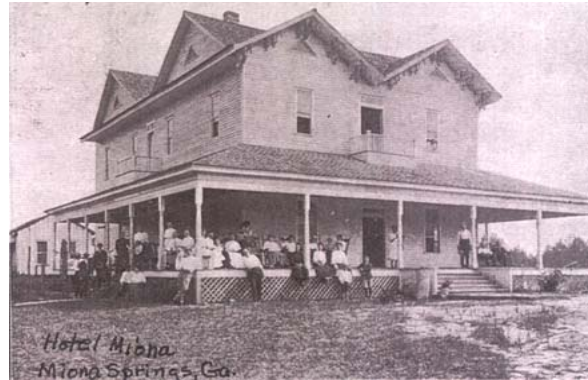
Miona Springs Hotel famed for flavored mineral springs

NORFOLK SOUTHERN RAILROAD GAVE THE MONTEZUMA DEPOT TO THE MACON COUNTY HISTORICAL SOCIETY IN 1980. THE NATIONALLY REGISTERED STRUCTURE WAS REHABILITATED IN 2002 AND NOW SERVES AS THE MACON COUNTY HISTORICAL MUSEUM. THE MUSEUM PRESERVES AND MAINTAINS MEMORIES OF THE EVENTS AND PEOPLE THAT SHAPED MACON COUNTY,